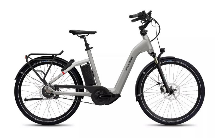
This is a partner tour