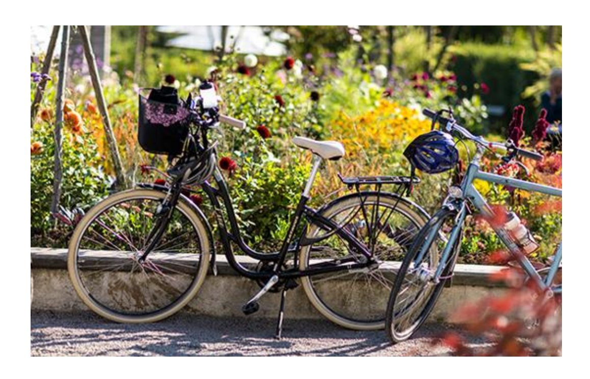
Day 7: Individual Departure Start your trip home, or stay a couple of extra nights

On your last stage you cycle along wonderful coastal paths as well as through a nature reserve to Erstavik. Afterwards you will pass world cultural heritage Skogskyrkogården (woodland cemetery), which is according to UNESCO an impressive example for the fusion of architecture and cultural landscape. After a few more kilometers you will be back in Stockholm again where you reach your hotel via the islands of Södermalm and Långholmen.