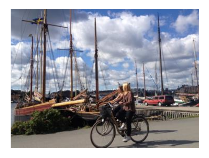
Day 6: Saltsjöbaden – Stockholm 35 km

Via Fågelbrolandet you cycle to the village of Gustavsberg. Not far away the Artipelag, a modern art museum with impressive art and sculptures on approximately 10,000 m2 is located. Via Skurusund Bridge (photo stop) you finally reach Saltsjöbaden, your today's destination. The idyllic small town is a very popular local recreation area.