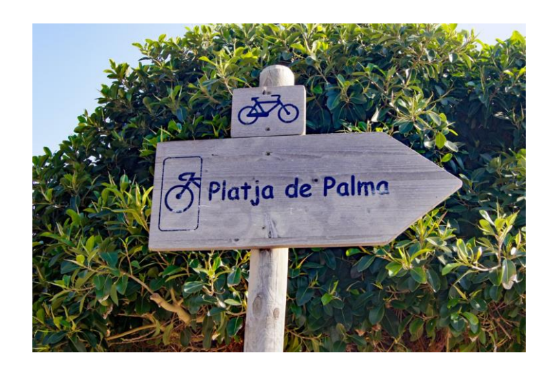
Day 8: Departure or extension of trip

Breath-taking views of the sea are accompanying you on the last cycling day. You will cycle trough the picturesque towns of Deia and Valldemossa until you get to the West coast of the island leading you to the city of Palma. The capital city with its narrow alleys and squares is a must to explore before you are heading back to where you have started you tour.