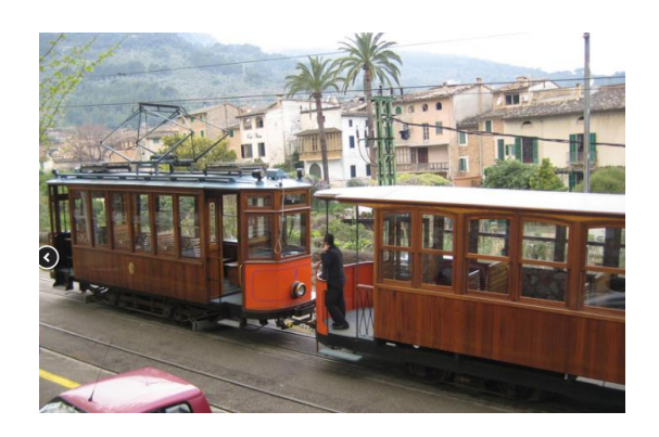
Day 7: Port de Sóller – Playa de Palma approx. 55 km

Breath-taking views of the sea are accompanying you on the last cycling day. You will cycle trough the picturesque towns of Deia and Valldemossa until you get to the West coast of the island leading you to the city of Palma. The capital city with its narrow alleys and squares is a must to explore before you are heading back to where you have started you tour.