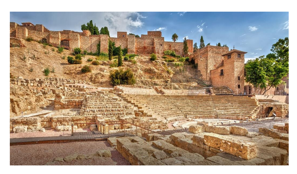
Day 8: Departure or extension

helped the city to futuristic buildings and great green parks.