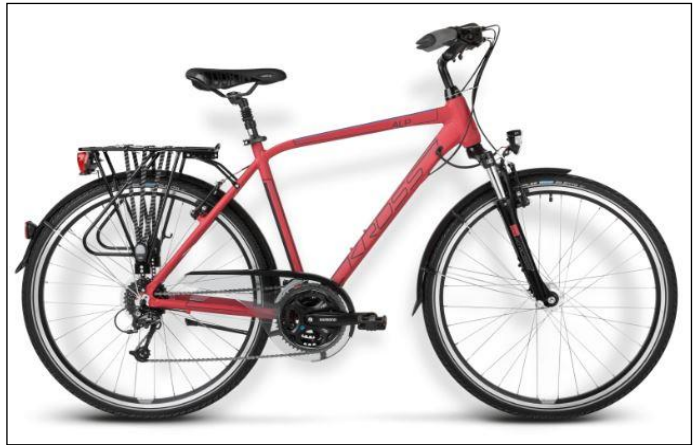
Trekking bike KROSS EVADO 6.0- Aluminum