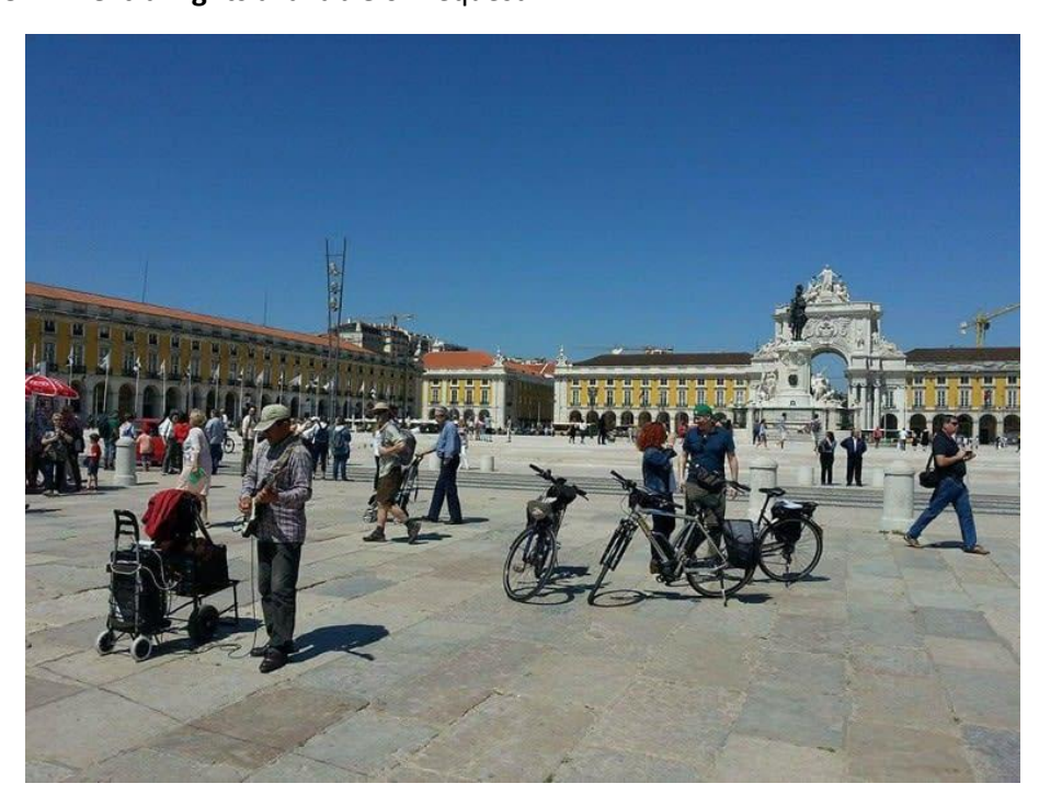
Day 2 - Lisboa to Costa da Caparica - (21 km)

Enjoy the glamour, history and vibrant culture that the city of Lisbon offers. With the travel pack we supply information for sightseeing to the capital of Portugal. To visit Alfama is one of our recommendation to find special views, history, culture and tradition in the most typical neighborhood of Lisbon. OPTIONAL: extra nights available on request.