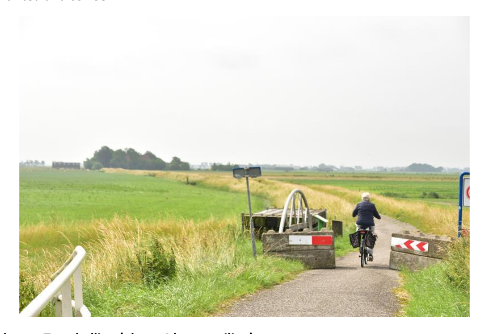
Day 3: Makkum - Terschelling (about 4 hours sailing)

Today your first bike ride is on the agenda. The route will follow the Frisian coast in a northerly direction. Along the way you'll pass through the historic harbors of Hindeloopen and Workum, both small picturesque fishing villages. In Workum you can visit a museum dedicated to the painter Jopie Huisman, who was an iconic local artist with a uniquely Frisian approach to life and art. Continuing by bike towards your destination of Makkum, you'll see a huge hall clearly visible in the distance. Inside, shipbuilders are busy constructing superyachts, large ocean-going vessels with everything on board that a human could possibly need or imagine. When you arrive in Makkum, the crew will welcome you back on board with tea and coffee.