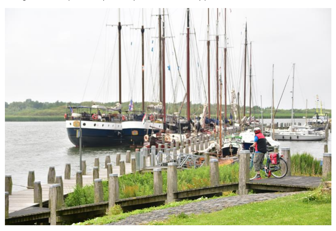
OK Cycle & Adventure Tours Inc. - 666 Kirkwood Ave - Suite B102 – Ottawa, Ontario Canada K1Z 5X9 www.okcycletours.com TICO Ontario Registration No: 50022848

With a detailed map of the area and a suggested route for close-range explorations, you decide where you head and how fast you ride. During the evening prior to next day's cycling tour, the ship's crew will explain some difficult parts, offer tips about the nicest places to stop for a drink or lunch, and mention the best highlights. In case of emergencies or problems, the crew can be contacted. But – as the ship is sailing to the next port – they can only offer assistance by phone.