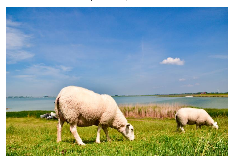
Day 5: Leeuwarden – De Alde Feanen – Grou (40 km / 24 mi.)

With another morning sail, the ship will head back to the mainland. Starting in the historic fishing town of Harlingen, you'll leave the coast for the first time this week to visit Franeker, another of Friesland's 11 cities. Here the Royal Planetarium is well worth a visit to see a working model of the solar system built by amateur astronomer Eise Eisinga in the 18<sup>th</sup> century. He planned to create it in six months, but in the end it took seven years. Today's destination is Leeuwarden, the capital of Friesland. Leeuwarden is a vibrant city with plenty of things to see and do. Among them, the church tower of Oldehoeve is certainly a highlight. Nicknamed the 'Frisian tower of Pisa' you can imagine how it looks! Dinner tonight (not included) will be in town in a restaurant of your choice (recommendations available on board).