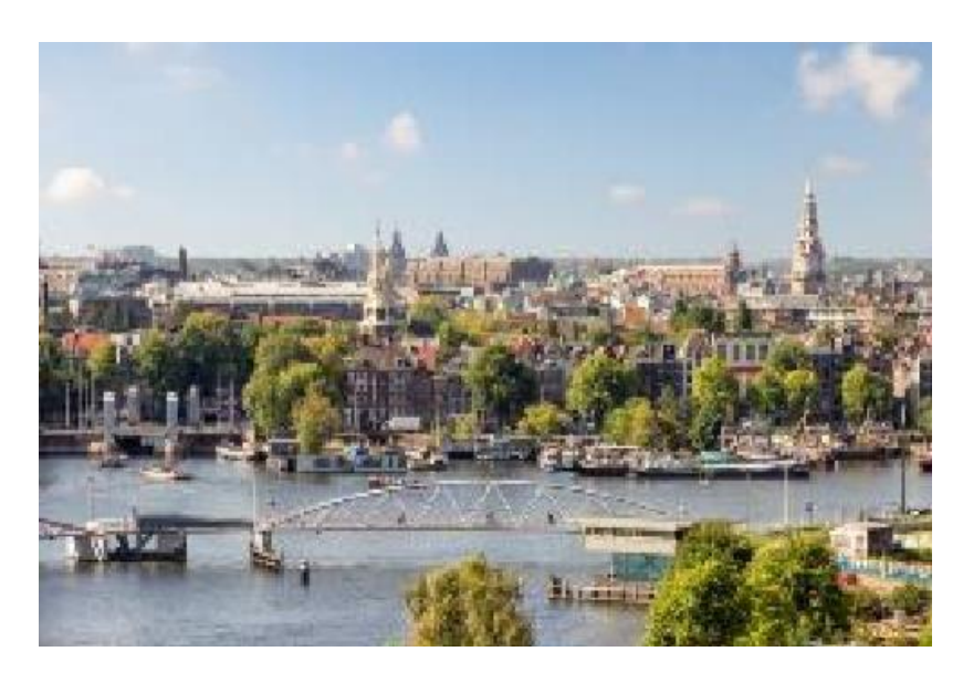
Day 8: Amsterdam: end of the tour after breakfast. Debarkation before 10 am End of the tour after breakfast, before 10 am.

afternoon and evening are spent in Amsterdam. While you are there take the opportunity to visit Anne Frank's home, the Rembrandt House Museum, the Royal Palace of Amsterdam, Dam Square, the very centre and heart of the city or maybe you could go on a canal tour (not included).