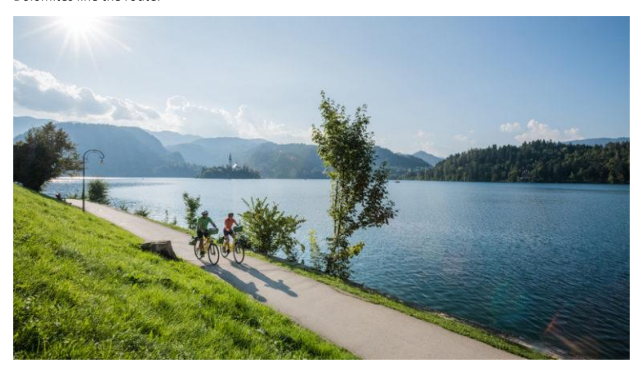
DAY 3: Oberdrauburg/Kötschach Mauthen – Feistritz an der Gail/Travis (transfer to the Gailbergpass + approx. 65 km)

Starting at the watershed of the rivers Drau and Rienz on the Toblacher Sattel, you ride alongside the Drau through South Tyrol and on to East Tyrol and the town of Lienz. The impressive mountains of the Dolomites line the route.