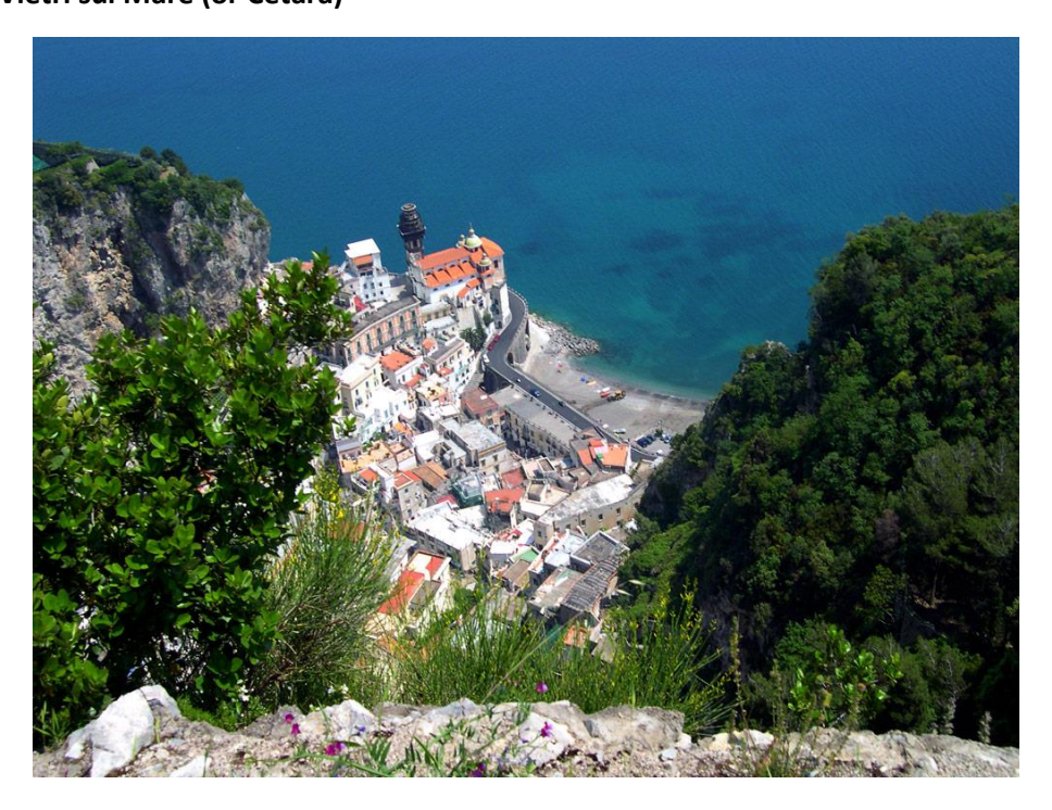
Day 2 – The 'eastern' Amalfi Coast: cycling along the beautiful road of Capo d'Orso to Vietri & Cetara, Minori, Maiori and Atrani, with an optional visit of Ravello

After your arrival at Salerno (train station) you travel to one of the villages at the most eastern part of the Amalfi Coast, either Vietri sul Mare, renowned for its colourful table ware ceramics or – in alternative – the nearby fishermen's village of Cetara. By the end of the afternoon, you'll meet for a short briefing with our representative and you can take hold of your bicycles. In case you arrive early you may want to take your bicycles for a short ride to either Vietri or nearby Cetara. In the evening you may go for a stroll through the historical centre of the small village and find somewhere nice to eat. Hotel*** – Vietri sul Mare (or Cetara)