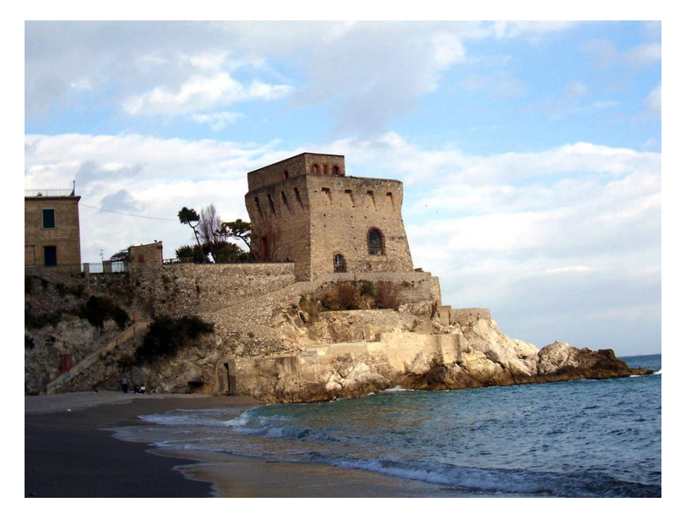
Day 6 - Departure

The tour ends in Sant'Agata after breakfast today.