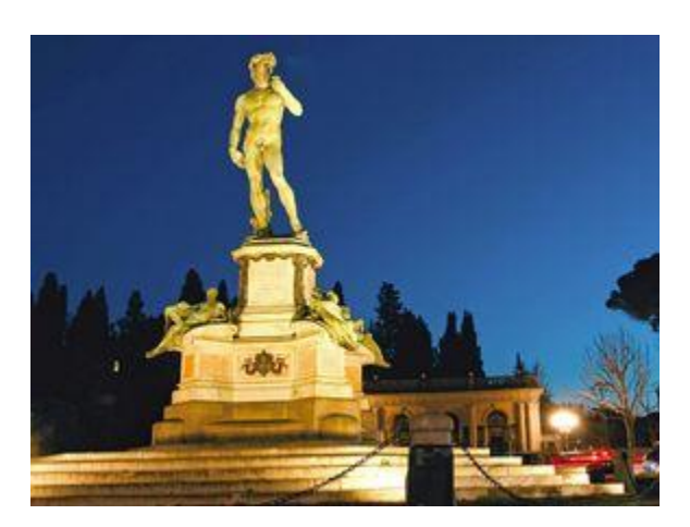
Day 6: Pistoia – Florence approx. 50 km

Soon after just a few kilometres follows the biggest and most challenging ascent this week. As a reward afterwards, you get a short break in the small Medieval village of Montevettolini as well as fantastic views on to the Arno valley during the rest of the tour. Then onwards to Pistoia, which is not so well-known by tourists and called ,Little Florence'. With its Montecatini Thermal Springs — Pistoia approx. 30 km charming squares and impressive churches one is indeed reminded of the neighbouring town Florence