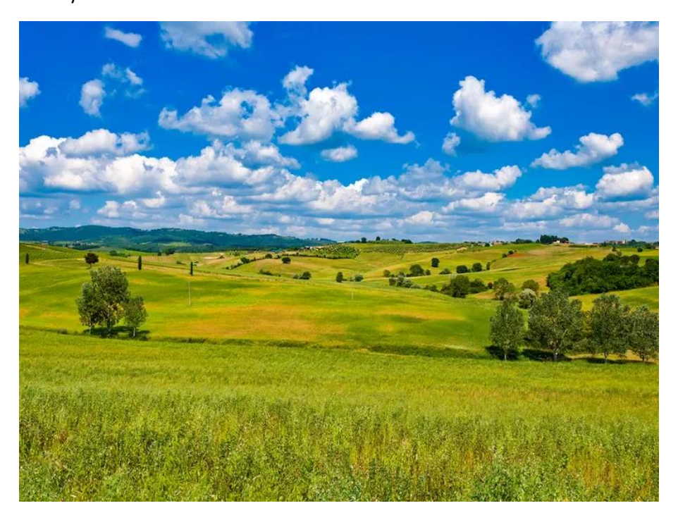
Day 2: Pisa – Lucca approx. 35 km

In the evening welcome briefing and bike fitting. We recommend an initial visit of the magnificent old part of town that day.