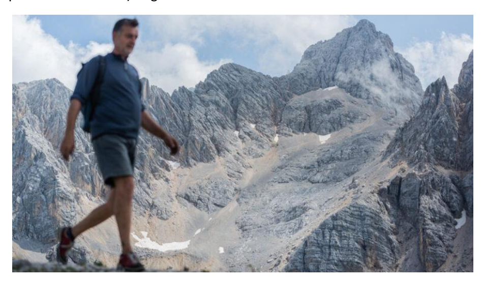
DAY 3: Plätzwiese – Strudelkopf or Dürrenstein; Strudelkopf: ascent approx. 360 m, descent approx. 360 m / approx. 3 - 4 hours or Dürrenstein: ascent approx. 850 m, descent approx. 850 m / approx. 4 – 5 hours

Your hiking holiday starts by the idyllic lake Pragser Wildsee, which fascinates the sightseer with the crystal clear turquoise waters of the lake. Here you get a first impression of the Pragser Tal; with its dark-needled coniferous forests and the whitewashed walls of the mountain rocks, it counts to the pearls of the Dolomites. The way leads you to the alpine pasture Rossalm and then to Plätzwiese. Beside calm and nature you get also a panoramic view: In the vastness you can see the mountains Cristallo, Tofana and the world-famous Drei Zinnen (Three Peaks). Leisurely walkers have the possibility to choose a variant for the first stage, at which they are taken to the guesthouse Tuscherhof and start their walk from there. Following the river Stolla they pass the guesthouse Brückele, the homonymous hut Stolla and rock paintings (cases of erosion, which are produced by the constant influence of water and the different composition of the rock) to get to the Plätzwiese.