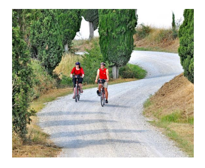
Day 8: Departure or Extension of Trip

First, you will cycle through the small, medieval wine town of Monte Carlo, where one of the few white wines of Tuscany flourishes. Then you will continue your tour along the Wine Road "Colline Lucchesi", through the backcountry, past the beautiful Villa Torriggiani to Lucca. A bike ride on the historic city walls offers magnificent views of churches and towers that rise above the countless roofs of the city. The train will take you back to your hotel.