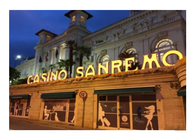
Day 8: Departure or extension

Your last day's cycle starts with a transfer to Imperia. This is the starting point of one of Italy's best cycle paths! Spectacular views of the turquoise blue sea along the Riviera of the Flowers are an absolutely cracking way to end your cycle tour. Enjoy the Ligurian sun on your bike before you get to Sanremo. You should however keep cycling along the bike path. The 1.7km long bike tunnel running along part of the famous Milan to Sanremo bike race is definitely worth seeing.