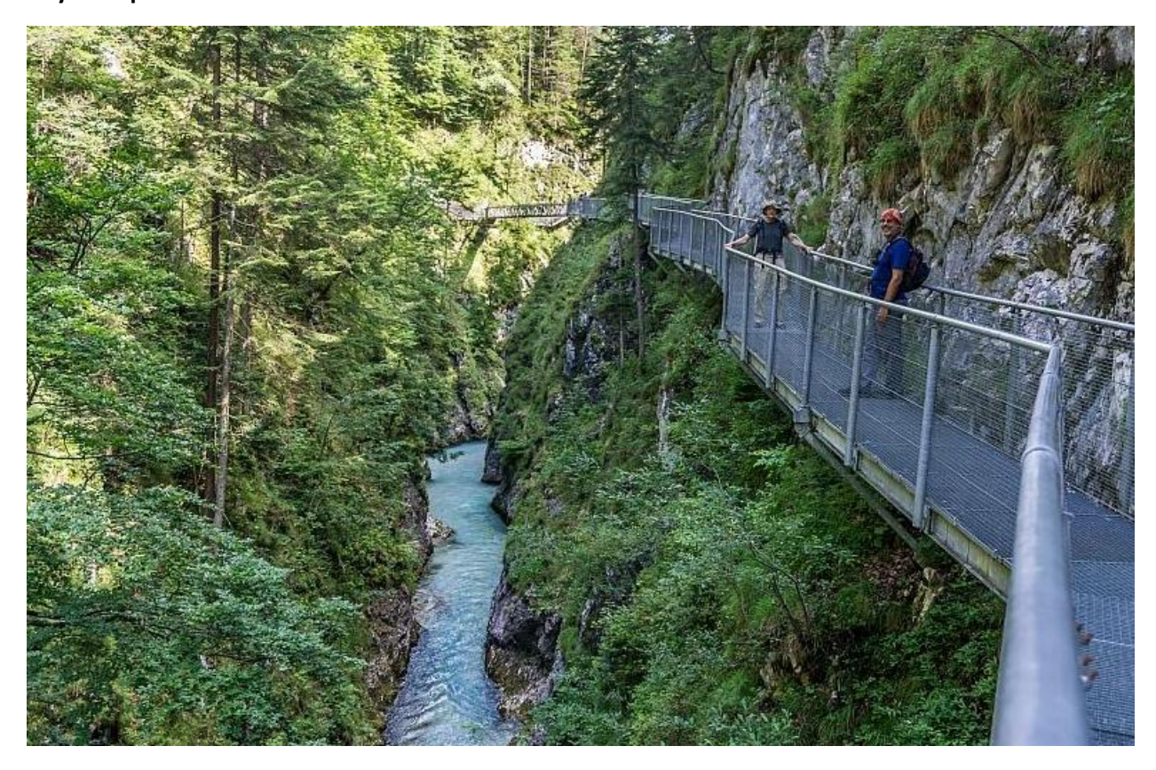
Day 7: Departure from Garmisch Partenkirchen

Bit by bit we walk up to the foot of mount Zugspitze and famous scenic view on Lake Eibsee. The tour ends at the lovely lake with Zugspitz-Garmisch panorama. Simply beautiful. If you like youmay take the cable car in Ehrwald to Mount Zugspitze or from Lake Eibsee. Return to Garmisch by train or bus.