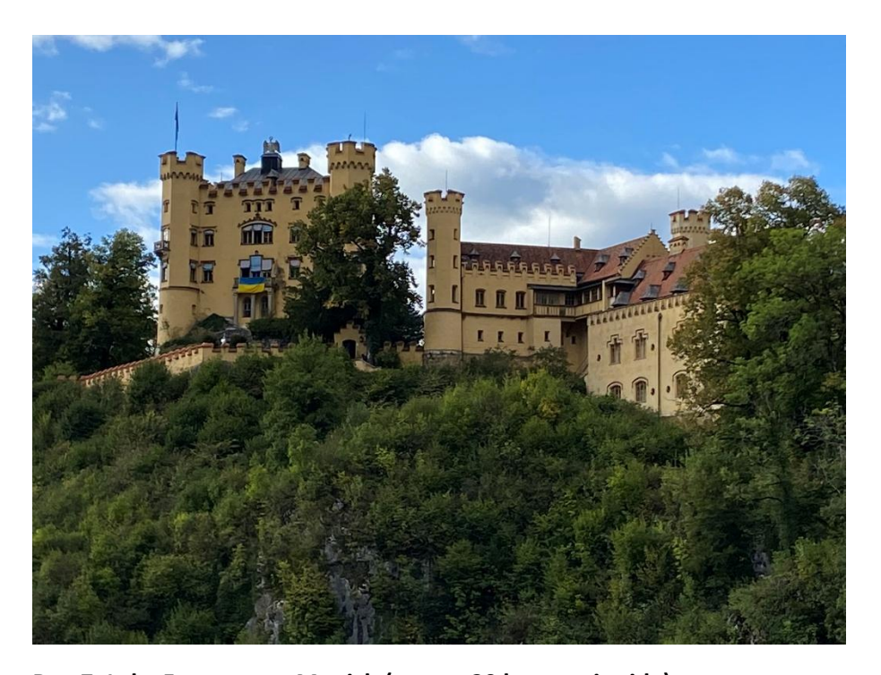
Day 7: Lake Forggensee-Munich (pprox..30 km + train ride)

You will begin your last cycling day with a round tour around lake Forggensee. Have a break at one of the many bathing spots and enjoy the view of the Allgäuer Alps. You then travel back to Munich from Füssen by train (incl., duration pprox.. 2 hours).