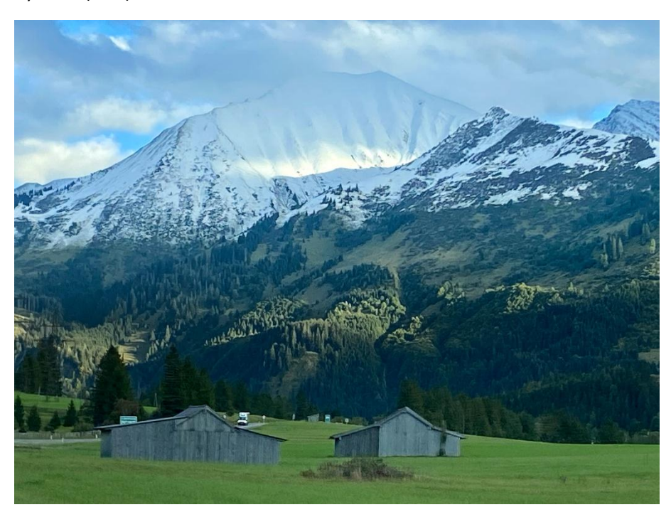
.Day 6: Schwangau/Füssen(approx. 60 km)

Today's cycling stage leads you mainly along the crystal clear Loisach River to Garmisch-Partenkirchen. Travel with the Zugspitzbahn onto the highest peak in Germany. You then travel back to Lake Staffelsee by train (incl.)