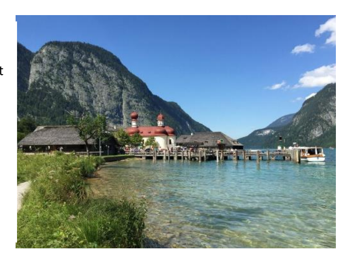
Day 8: Individual departure or extra day

Short train ride and then ascent to a glorious and remote forest area. High altitude paths with incredible panoramic views lead you along the mountainside with the 'Steinerne Meer' mountain range and the two summits Watzmann and Hochkönig in front of you. Then a short section along the brine pipeline path, before you ascend through the forest to the Grünstein Mountain. Glistening deep down below you is Lake Königssee, green in colour, with boat houses and little boats, set amidst the national park Berchtesgaden and is the picturesque finish of your hiking holiday.