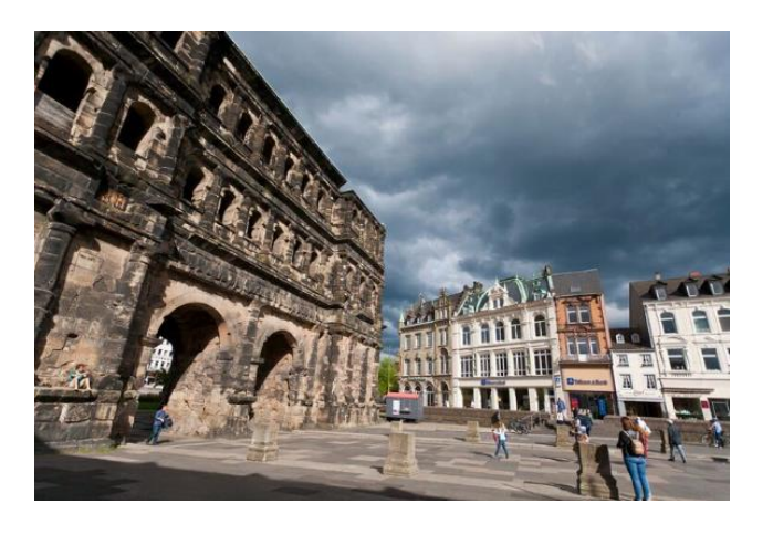
Day 7: Individual departure or extra days