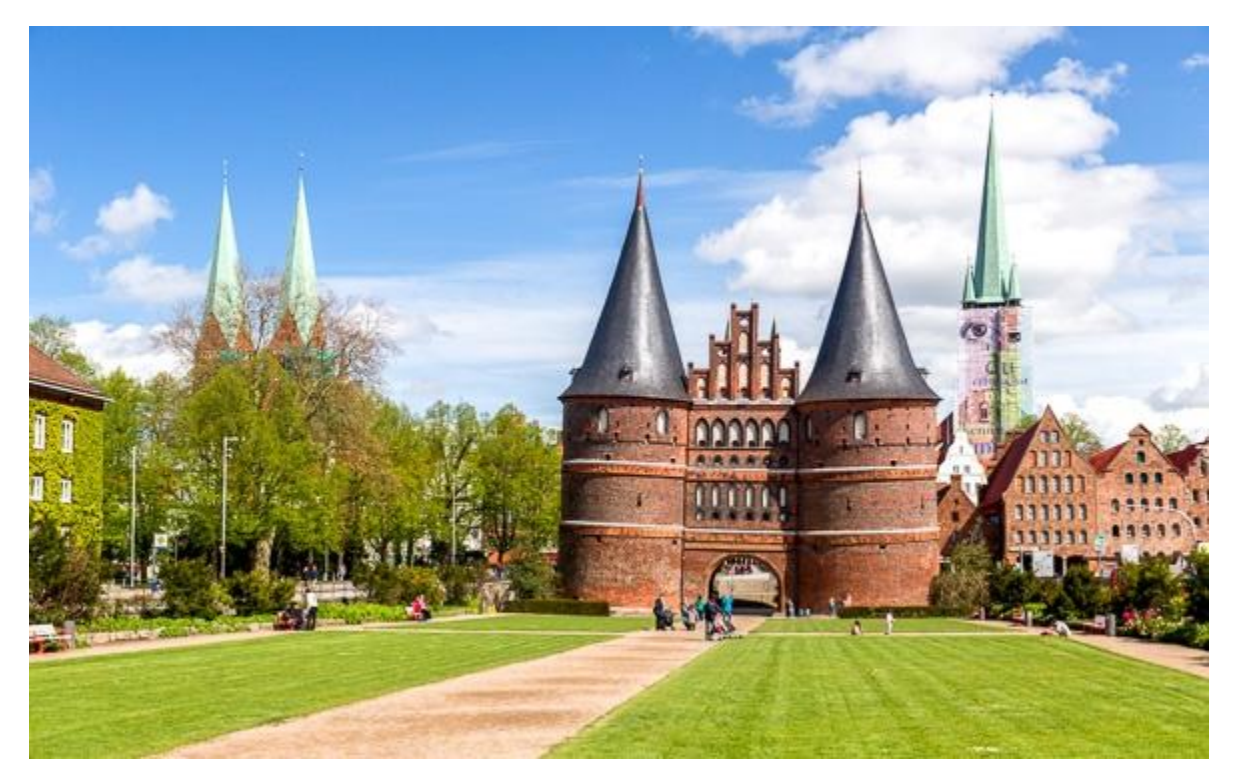
Day 2: Lübeck – Gross Schwansee / Boltenhagen, approx. 35 / 45 km + ferry trip

The old magnificent Hanseatic town was named a UNESCO World Heritage Site in 1987 and simply radiates charm. Most people associate Lübeck with the Holsten Gate, marzipan and Thomas Mann. But there is much more to see: the crooked brick houses, alleyways and courtyards, the town hall. And the fish rolls on the banks of the Trave at sunset taste particularly good.