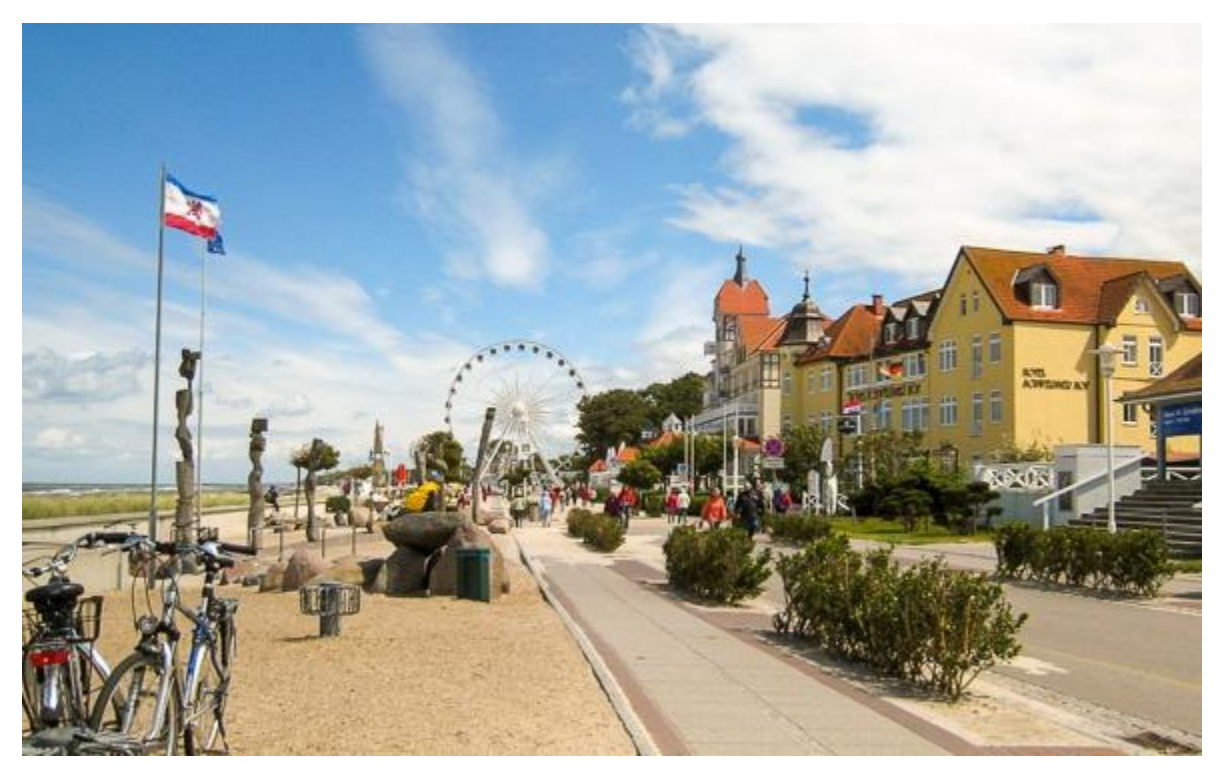
Day 5: Kühlungsborn – Wustrow / Ahrenshoop, approx. 30 – 60 km + ferry ride

Today you have the opportunity to pay a visit to the island of Poel. Take the ferry to the small island, enjoy the peace and quiet and have fun swimming on one of the many island beaches. Alternatively, cycle close to the coast to the Baltic seaside resort of Kühlungsborn. If you are staying overnight in Warnemünde, take the steam-powered Molli spa railway from Kühlungsborn, which will take you comfortably to Heiligendamm. It is only a few kilometres to Warnemünde.