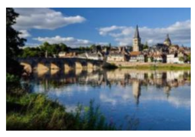
Day 8: Nevers, end of tour after breakfast Disembarkation before 10 AM.

We end this week in the heart of France with a short ride to the town of Nevers where there are many sites to see including the winding streets filled with houses dating back from the 14th to 17th century. The origins of Nevers date back to Roman times. Nevers is since the 5th century the seat of the bishop and has among others a castle and a few interesting churches. To celebrate the end of your cycling week you can of course also take a well-earned rest on the several terraces in town and enjoy the local wine.