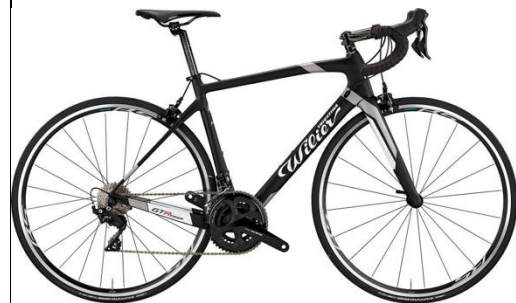
Carbon road bikes

Gears: 2x11 Shimano 105, chainring 34-50T, cassette 11-30T Equipment: cycle computer, water bottle holder, saddle bag containing spare tube and tire lever, hand pump, lock. This bike is available in following frame sizes: S (158-168cm), (M (169-177cm), L (174-182cm, XL (179-187cm) AVAILABLE PEDALS: flat pedals (included), toe cages and clipless pedals (SPD, SL, LOOK) with supplement