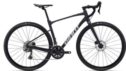
Gravel bike Giant Revol 0/1

Gears: 2x11 GRX Brakes: hydraulic disk brakes Equipment: cycle computer, water bottle holder, saddle bag containing spare tube and tire lever, hand pump, lock. This bike is available in following frame sizes: S, M, ML, L, XL AVAILABLE PEDALS: flat pedals (included), toe cages and clipless pedals (SPD, SL, LOOK) with supplement.