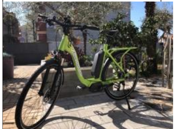
Custom built E-bikes

AVAILABLE PEDALS: flat pedals (included), toe cages and clipless pedals (SPD, SL, LOOK) with supplement.