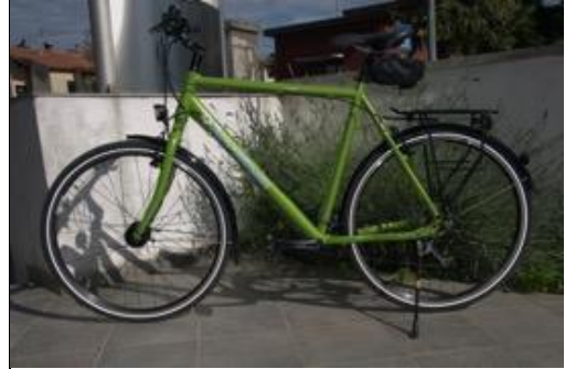
Custom built hybrid/trekking bikes

AVAILABLE PEDALS: flat pedals (included), toe cages and clipless pedals (SPD, SL, LOOK) with supplement.