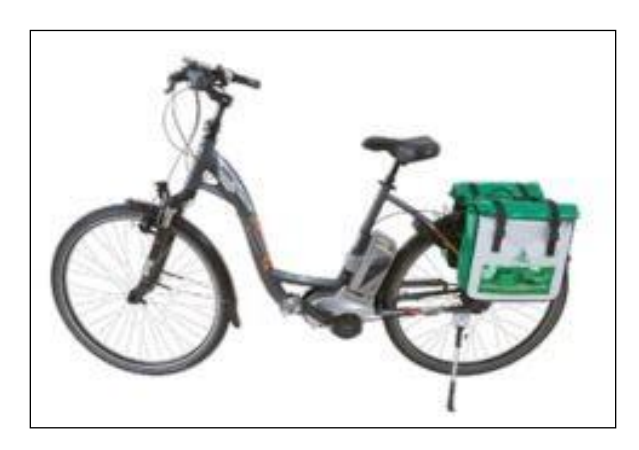
THIS IS A PARTNER TOUR FOR MORE INFORMATION CONTACT