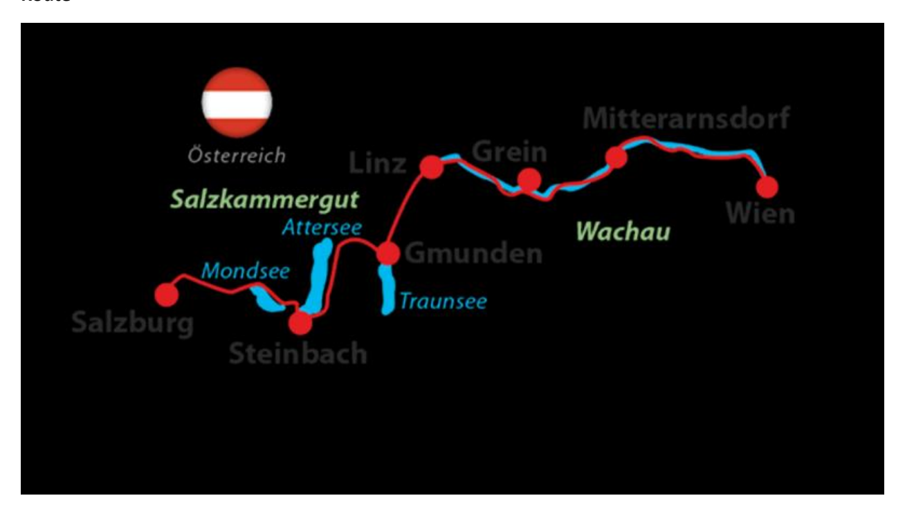
310 km 30–65 km daily, flat and gently hilly 3- and 4-star hotels

Travel Season: Daily departures April 26- October 11