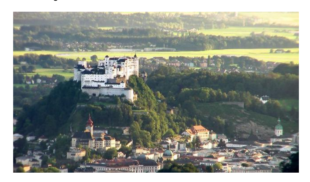
Day 8: Departure from Salzburg

You start following a cycle trail into the Saalach valley to the village of Weißbach where you find a wonderful gorge to visit. Afterwards there will be three heavy ascents to the Hirschpichl mountain pass. These ascents are up to 30% of elevation but quite short. At the pass you will pass the frontier to Germany and a nice restaurant awaits you (and many other walkers and bikers). Downwards you will cycle through the national park of Berchtesgaden (wonderful valley) to Lake Hintersee and onto the famous Lake Königssee. A wide road will lead you to the festival city of Salzburg where you should take a rest in a coffee house next to the river Salzach – the best impression of Salzburg! Overnight in Salzburg.