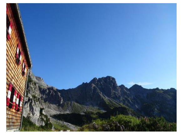
Day 1: Individual Arrival in the Ramsau